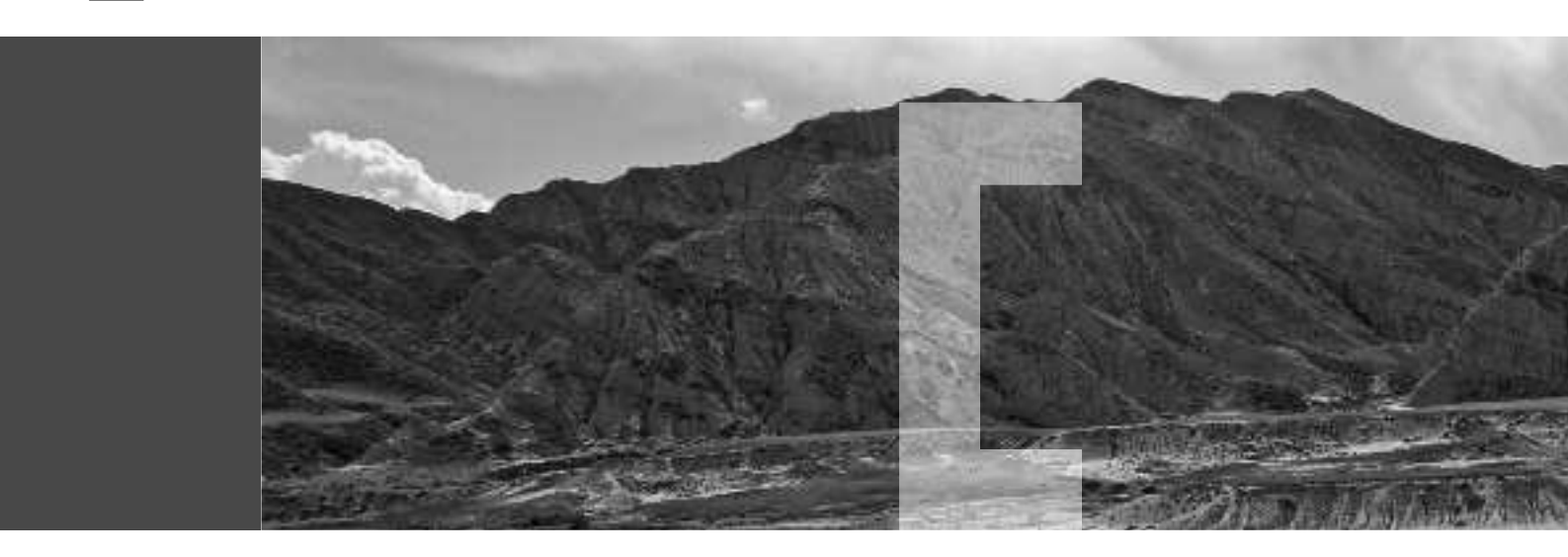
Soil erosion caused by overgrazing in Jergetal

Kyrgyzstan | Playing with a purpose for sustainable pasture use