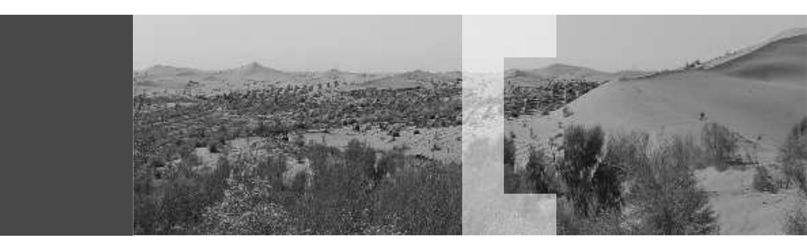
In the long term only stable vegetation cover can protect the houses from the sand – dune stabilisation in the Karakum.