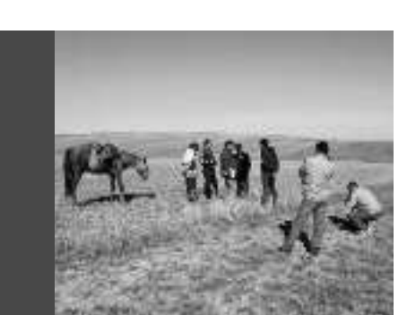
Project staff discuss an improved pasture management system with livestock farmers.

To promote the conservation and later sustainable use of the Saiga antelope and other endangered species, GTZ is working with the Association for the Conservation of Biodiversity in Kazakhstan (ACBK), which also receives support from the Frankfurt Zoological Society. The project addresses the coordinated management of protected areas and hunting grounds with the aim of introducing comprehensive control and management of these areas. For the first time in Kazakhstan, managers and staff of protected areas and hunting grounds are being trained together in the conservation and sustainable use of wildlife. This began at the end of 2009 with the first phase of the planned three-year project.