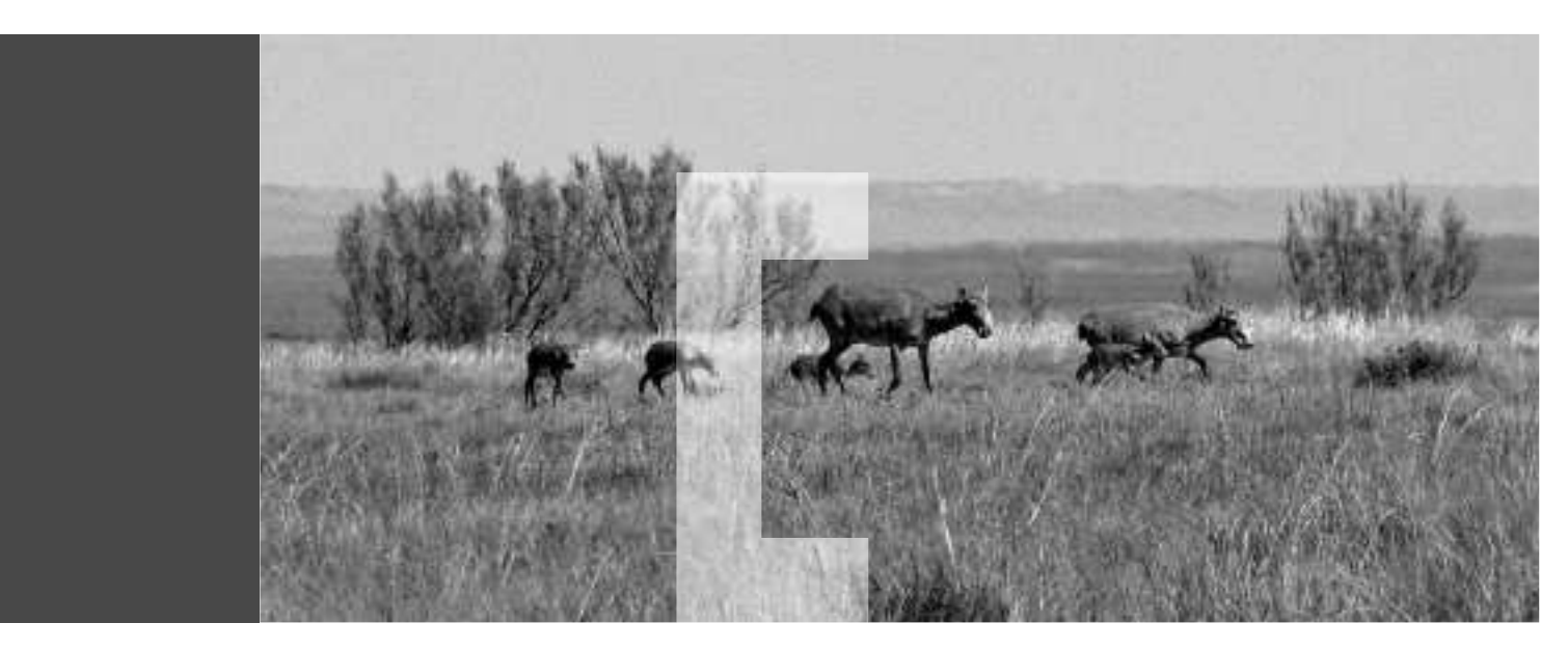
Saiga with their young in the Betpak Dala steppe in central Kazakhstan.