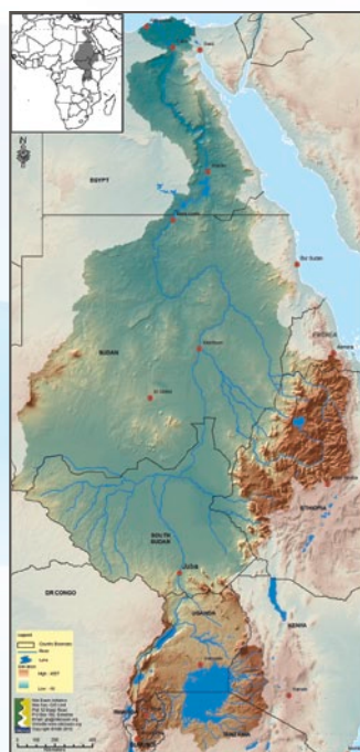
Topographic map of the Nile basin

and has demonstrated the benefits of cooperation to its member countries. On the sub-basin level, the NBI is coordinating concrete investment projects for infrastructure development and resource conservation with a total value of around 1 billion USD, including hydropower generation and power transmission projects. The population of the Nile basin is the ultimate beneficiary of those investment projects on the ground.