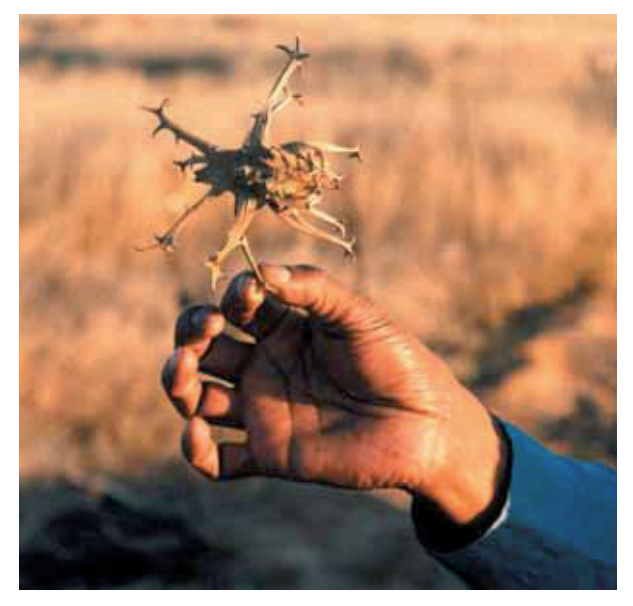
Devil's claw (Harpagophytum procumbens), Namibia.

Products from rare useful plants and animals whose preservation is at risk – so-called agrobiodiversity products – provide numerous opportunities for private industry. Marketing these products or otherwise promoting agricultural biological diversity enables companies to gain access to new groups of customers, make more profit and build up an image of being ecologically and socially responsible. At the same time, successful marketing gives the producers and breeders of such rare plant varieties and animal breeds an incentive to continue conserving them. This secures a rich gene pool which future generations will be able to draw on to continue developing and adapting agriculturally useful plants and animals to changing environmental conditions.