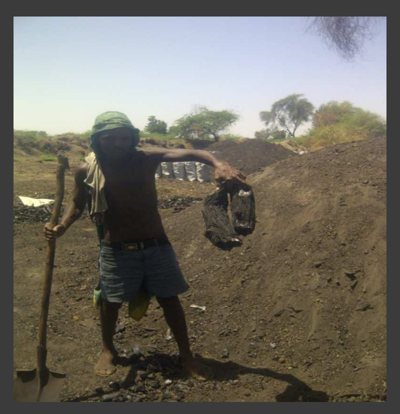
During production process