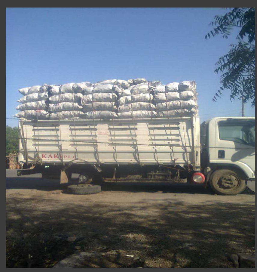
Charcoal transported by ISUZU truck for long distance