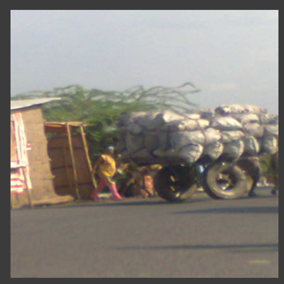
Charcoal transported by donkey cart for short distance