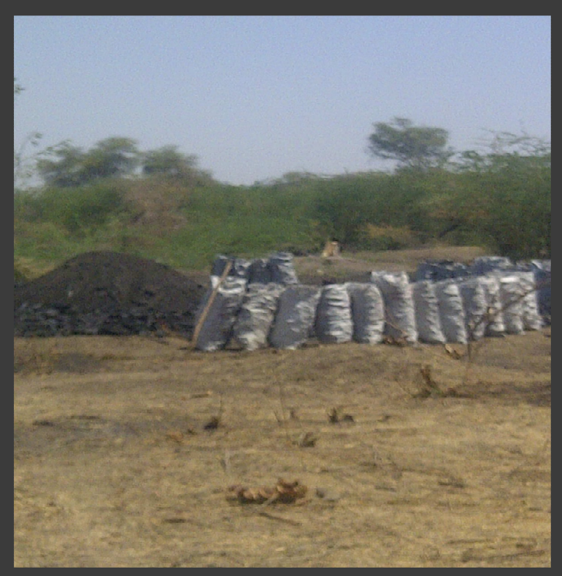
Charcoal sacks ready to be picked up by ISUZU